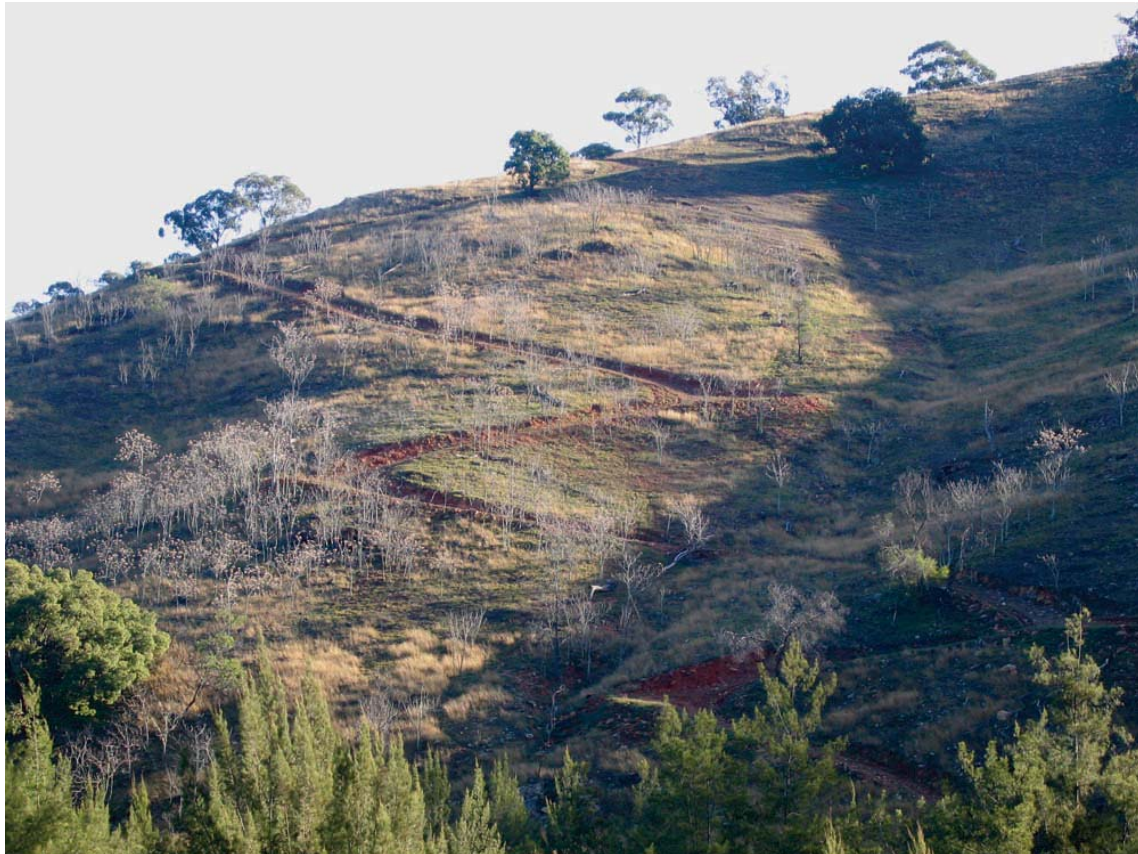
Figure 5. Access track and Tree of Heaven (weed species) on Lot 41 DP 47253.

Lot 45 can be accessed from private land on the plateau, on a track which reaches the south-eastern boundary of the lot and then continues through private land. Another track descends steeply from private land on the plateau north of the river through Lot 41 to the river. These two tracks connect along the northern bank of the river. The only known access to the river further downstream is a track which descends from private land on the southern side to the river some two kilometres upstream of Boshes Creek.