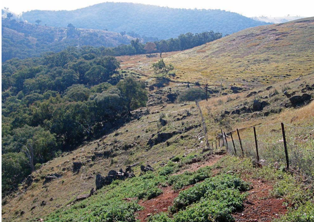
Figure 6. View northwards along the south-eastern boundary of Lot 45 DP 47253 towards the valley of Ulmarrah Creek. The fenceline seems to lie approximately along the surveyed boundary (as interpreted from GIS).