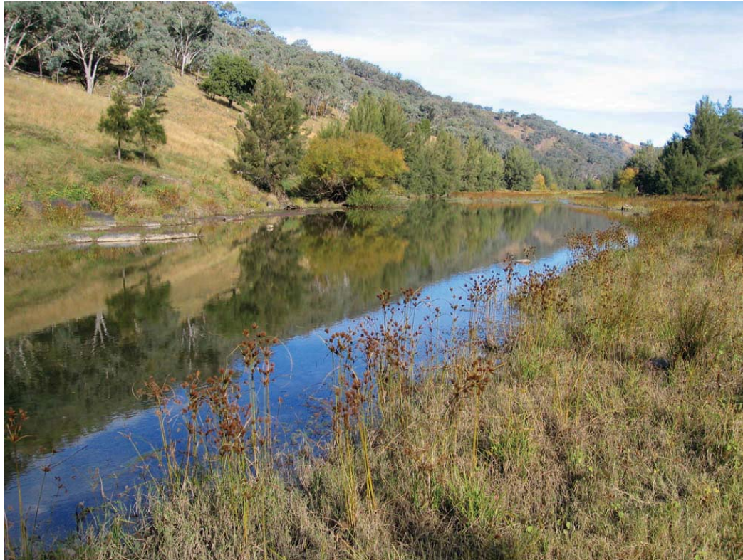
Figure 8. River scene looking upstream from the northern part of Lot 7302 DP 1129250, across to the northern part of Lot 206 DP 871982. River Oak regrowth and Willows are visible.

Recent management has been limited to weed control as part of an integrated program with local landholders and councils.