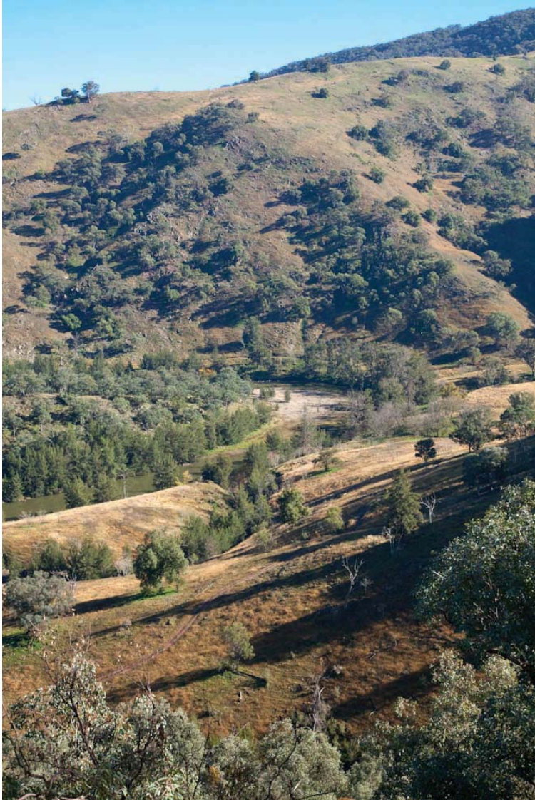
Figure 9. Dixons Long Point, looking north-west