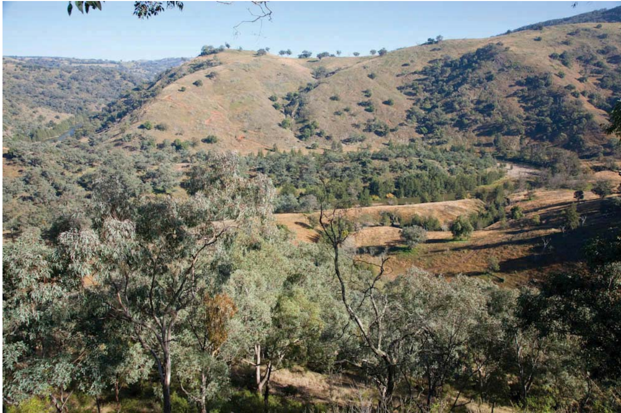
Figure 1. View west over Dixons Long Point and Macquarie River from the edge of the plateau within Lot 45 DP 47253. Woodland of Red Box appears in the foreground. Lot 41 DP 47253 takes in the cleared slope of the skyline ridge falling to the river and continues downstream around the bend.