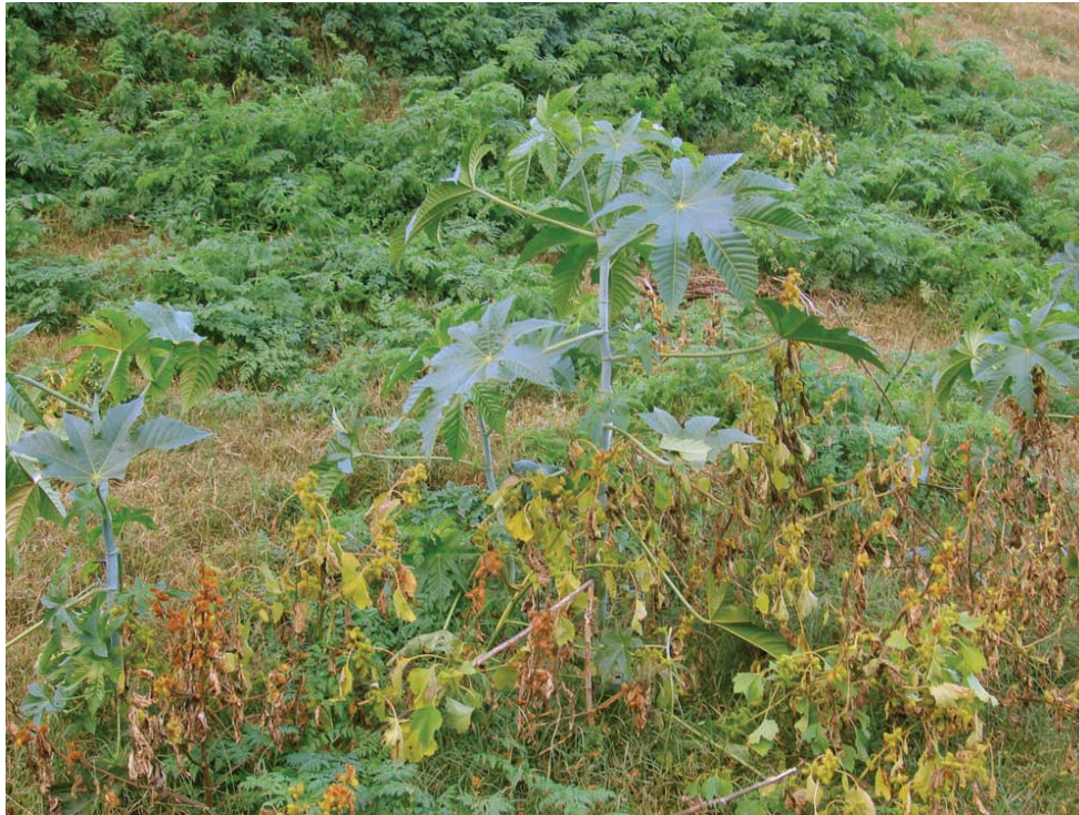
Figure 7. Mixed weeds on river flat of Lot 7302 DP 1129250, showing Castor Oil Plant, Noogoora Burr and Hemlock.

Blackberry clumps are present along cleared drainage lines and riverbanks and provide harbour for rabbits (which are uncommon). Tree of Heaven and Serrated Tussock both occur sporadically in cleared areas. Serrated Tussock has been subject to control programs. Tiger Pear occurs in low numbers on the valley slopes, including within relatively undisturbed bushland. Noogoora Burr is widespread along the banks of the Macquarie River. Briar, Common Thornapple, Bathurst Burr, Willow and Castor Oil Plant have a scattered distribution along the river banks. One clump of Giant Reed grows on the river bank of Lot 206. Hemlock occurs in a dense cover on moist, shaded areas of riverbank, such as on Lot 302 on the western bank.