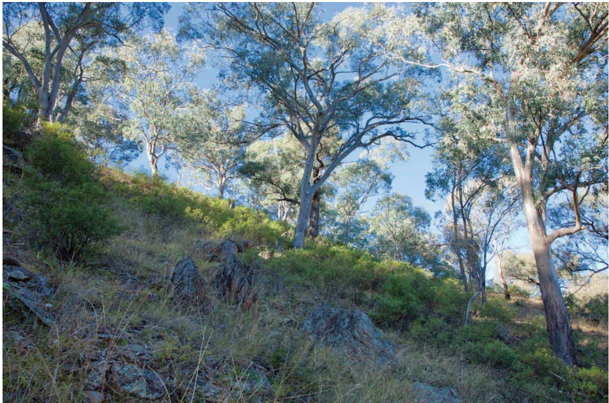
Figure 3. Open forest dominated by Red Box on steep rocky slopes within Lot 45 DP 47253. Sticky Daisy Bush dominates the understorey.