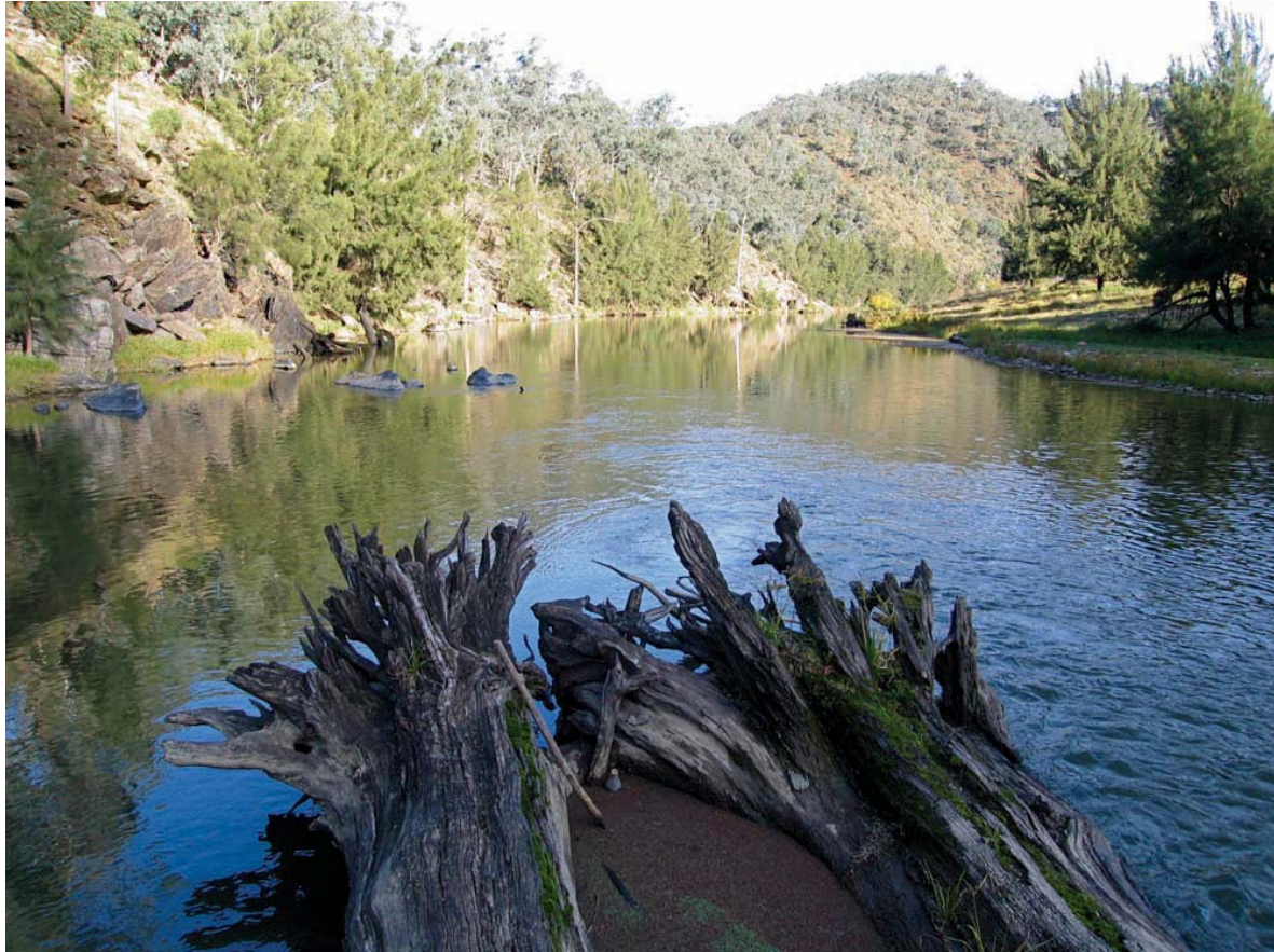
Figure 4. River scene looking downstream of Dixons Long Point. Lot 7301 DP 1129250 on the left (south) bank and Lot 7311 DP 1129242 on the right (north) bank. Regrowth of River Oak along the riparian strip can be seen, and on higher slopes the grey crowns of open forest dominated by White Box.

The year of the last wildfire in the reserve is unknown, and fuel levels are generally low. Achieving appropriate fire regimes is an important objective in managing vegetation for biodiversity conservation.