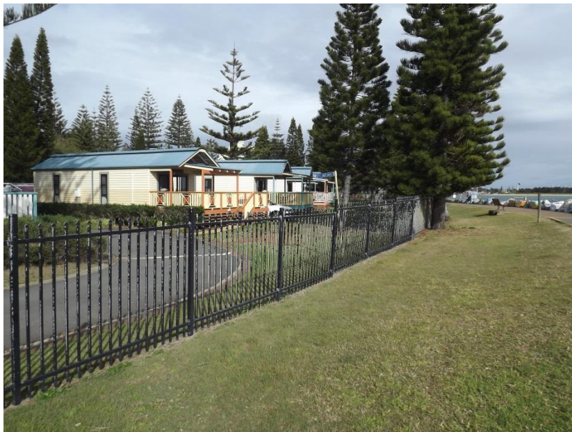
View west along the breakwall adjacent to the Sundowner Breakwall Tourist Park