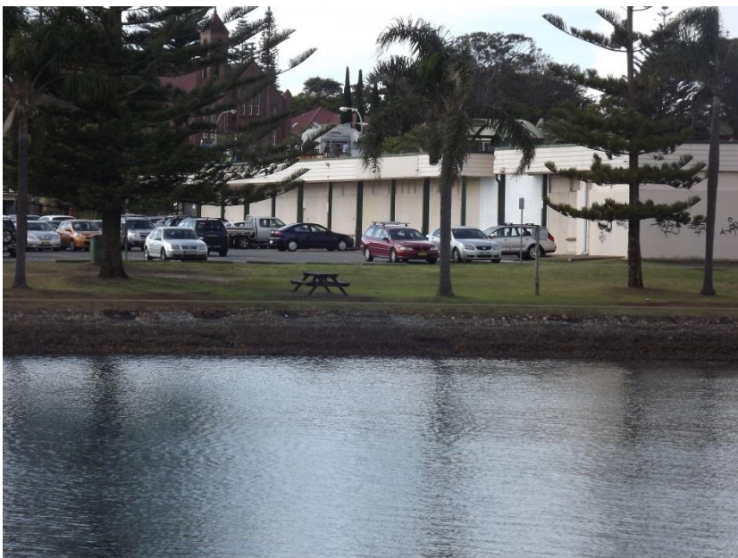
View across Kooloonbung Creek to the Plaza Car Park