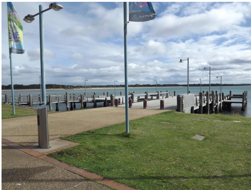
Lady Nelson Wharf on the edge of Town Green

Together they inform the strategic framework and direction for the PoM.