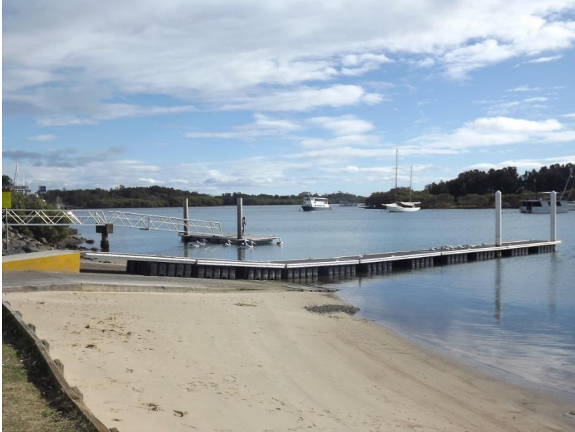
Public wharf/ pontoon at Westport Park