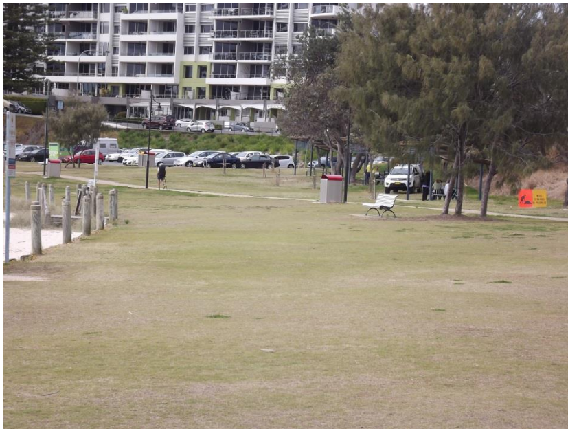
Town Beach Reserve Looking toward the Southern end and car park