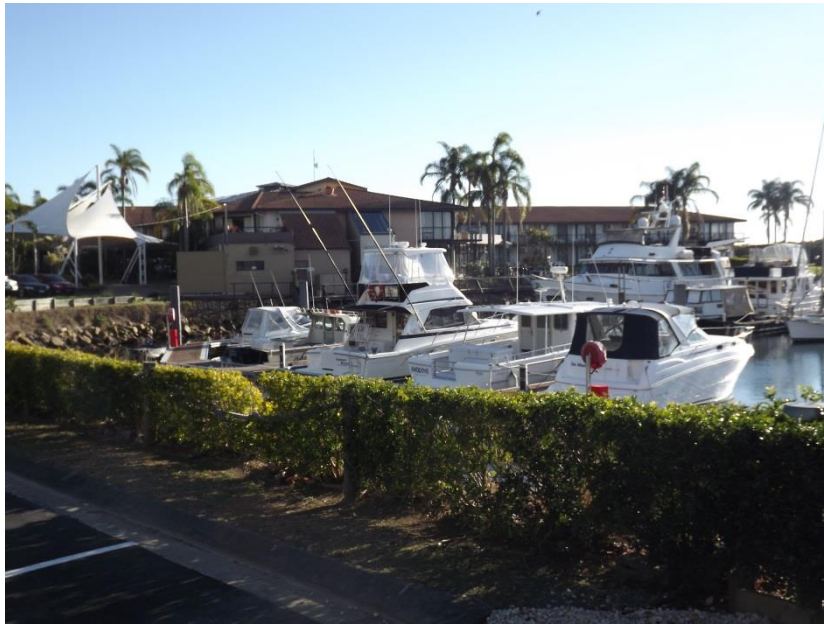
View of Sails Resort and Marina from the Marina Car Park