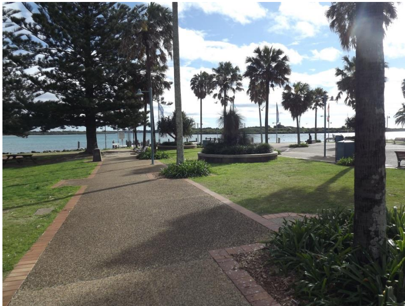
View across the Town Green from Clarence Street

Subsequently, Port Macquarie has grown to become a major regional coastal centre. It is important to the long-term social and economic well-being of the people of the Mid North Coast of NSW. As one of the few regional town centres located directly on the water's edge, Port Macquarie has also developed into a prime tourist destination.