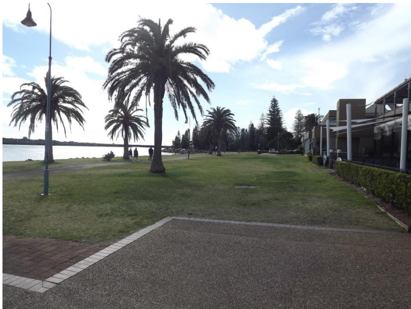
Town Green / commercial precinct links at the Royal Hotel