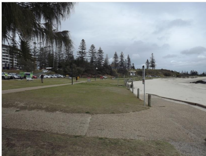
View from the Southern End of Town Beach

At the southern end the Town Beach Kiosk is host to the local control centre for Marine Rescue NSW as well picnic settings and play equipment.