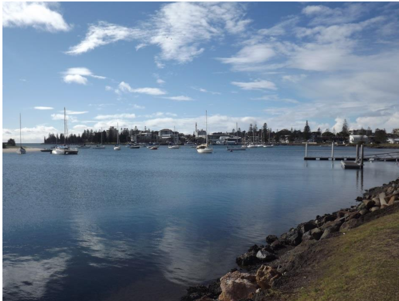
The commercial centre moorings and Foreshore from Westport Park